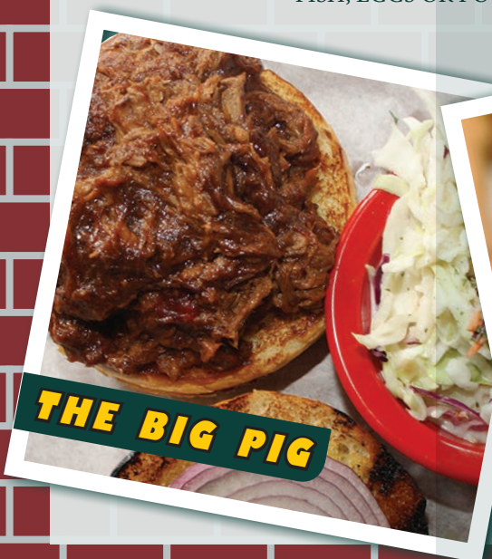
THE BIG PIG

*STEAKS AND HAMBURGERS ARE COOKED TO ORDER. CONSUMPTION OF RAW OR UNDERCOOKED MEAT, FISH, EGGS OR POULTRY MAY INCREASE THE RISK OF FOOD-BORNE ILLNES.S